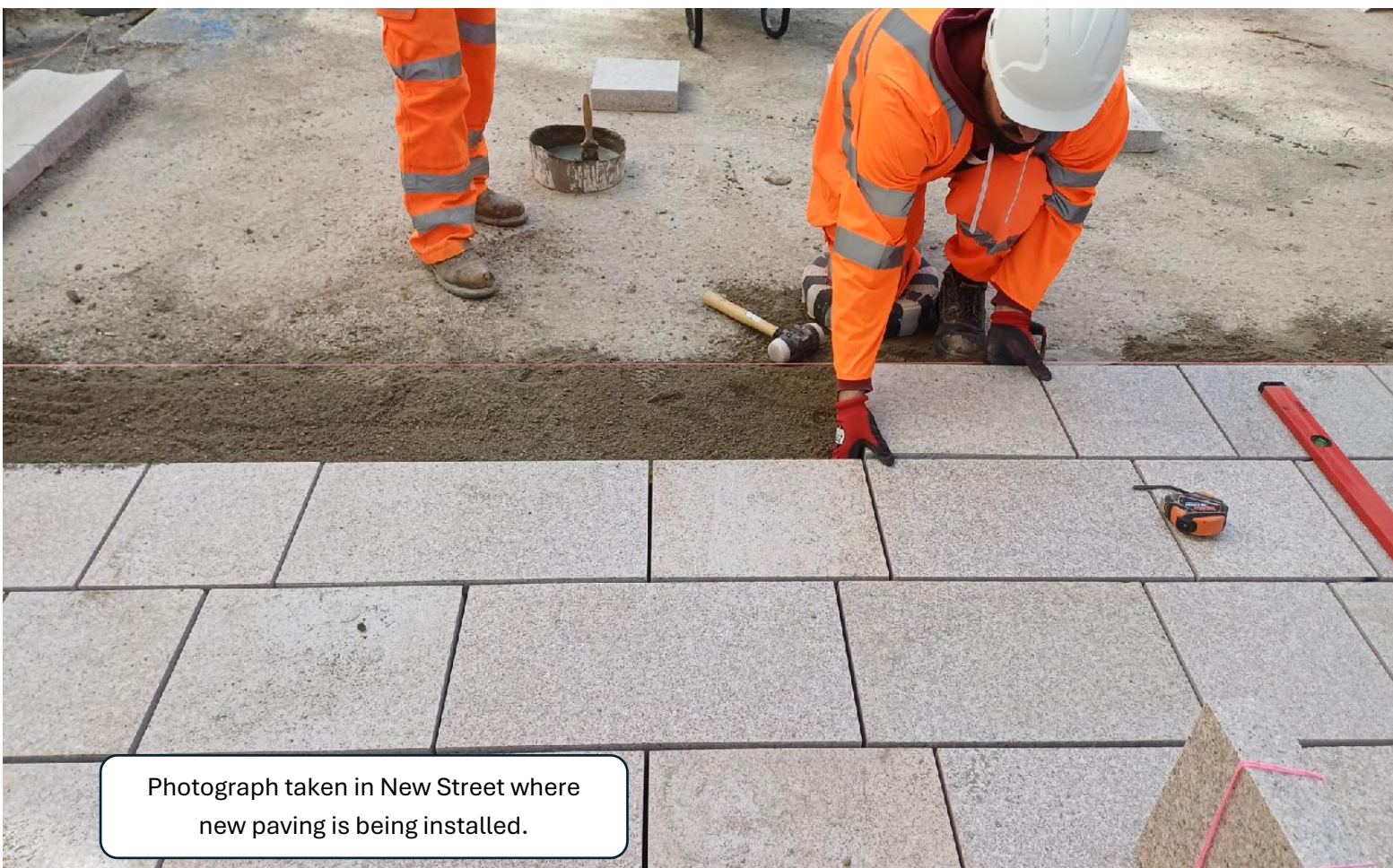
Photograph taken in New Street where new paving is being installed.

CPC Civils are delighted to be working with the City Council on this prestigious project.